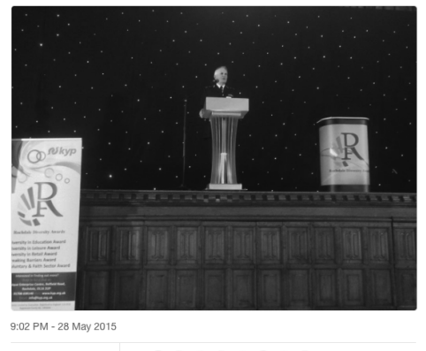
14 Retweets 11 Likes 🕬 💮 🎲 🏐 🖑 🗐 💮 🗊

"Over 200 languages are spoken in Gtr Manchester, reflecting the strength of our diversity' @gmpfahy #WeStandTogether